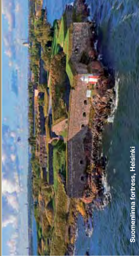
Suomenlinna fortress, Helsinki

bon appetit culinary center Aboard Marina