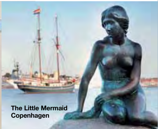
The Little Mermaid Copenhagen