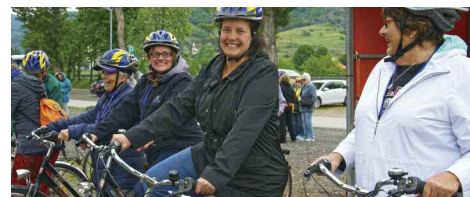
Biking along the Danube

Timeless Vienna. Discover the history of Vienna, an elegant and timeless city.