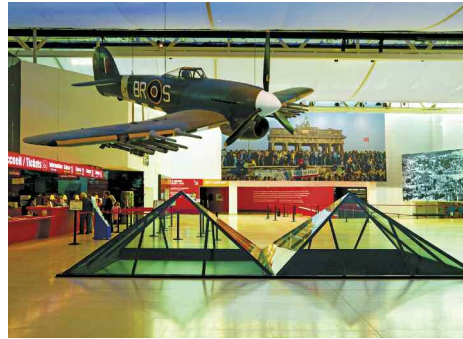
Caen Memorial Museum

D-Day and the Battle of Normandy. Discuss the role that Normandy and its citizens played during this crucial period of the Allied war effort.